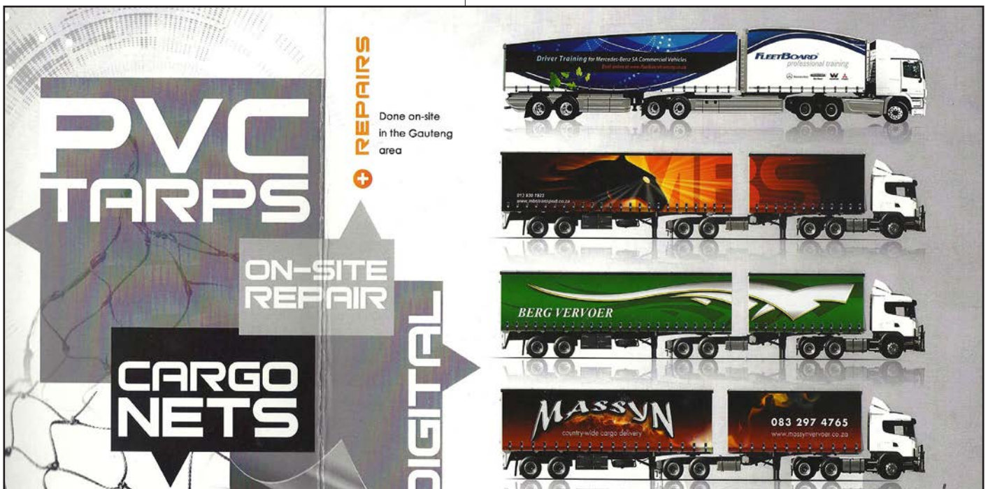
Promotion for digital truck cover services using Cgate tarpaulin

Tarpaulin is one of those products that has multiple applications, from marquees to high strength protective curtains. Using printable tarpaulin on trucks is a great platform for advertising and corporate image designers have used their creative skills to generate some extremely eye catching Trompe-L'oeil designs such as the images on the right.