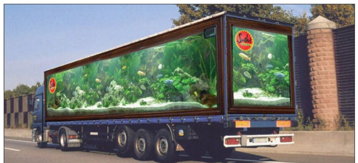
The above 2 images show designs for creative truck covers. The banner may not have been supplied by Cgate.